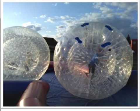
Yes, there is a child inside that giant "human hamster ball!"