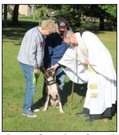
Saturday, October 5