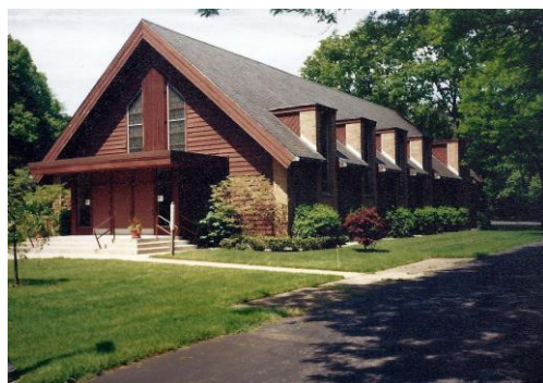
St. Michael's in the Hills, early 1960s

The early years of this century were very comfortable. We were a large, healthy, well-cared-for congregation with lots of energy devoted to Sunday School Education, Adult Education, Music and Outreach. Many of "the old guard" have now passed, often leaving us generous legacies of funds and leadership. The number of parishioners has declined, as in many churches everywhere, but the Spirit is strong here. We have discovered unknown strengths in our resolve, dedication and love. We have a very strong Vestry, staff who are resilient, creative and caring, and a committee system that functions effectively to manage our daily activities and needs.