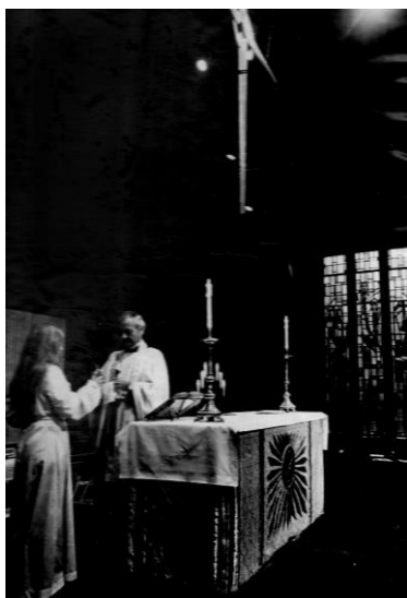
At the altar, 1972