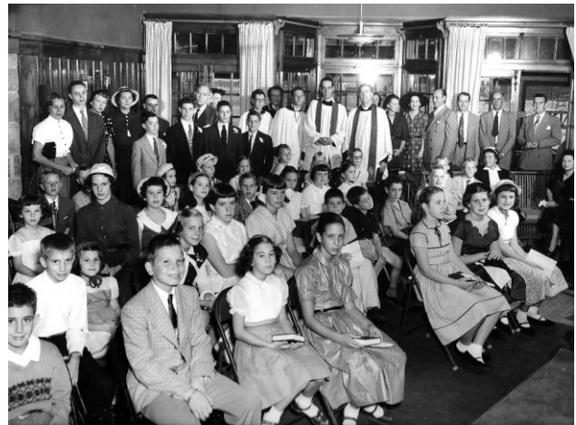
St. Michael's at the tennis club, 1950s